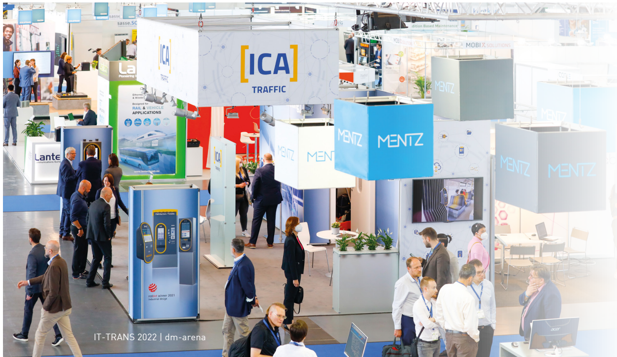
IT-TRANS 2022 | dm-arena

ENHANCE YOUR BRAND AWARENESS' ON-SITE and ONLINE